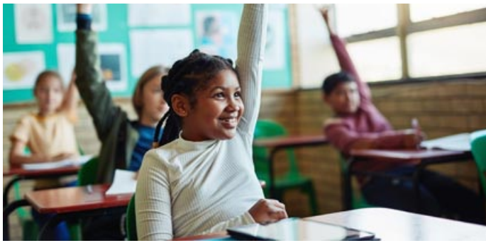
Schools & Childcare