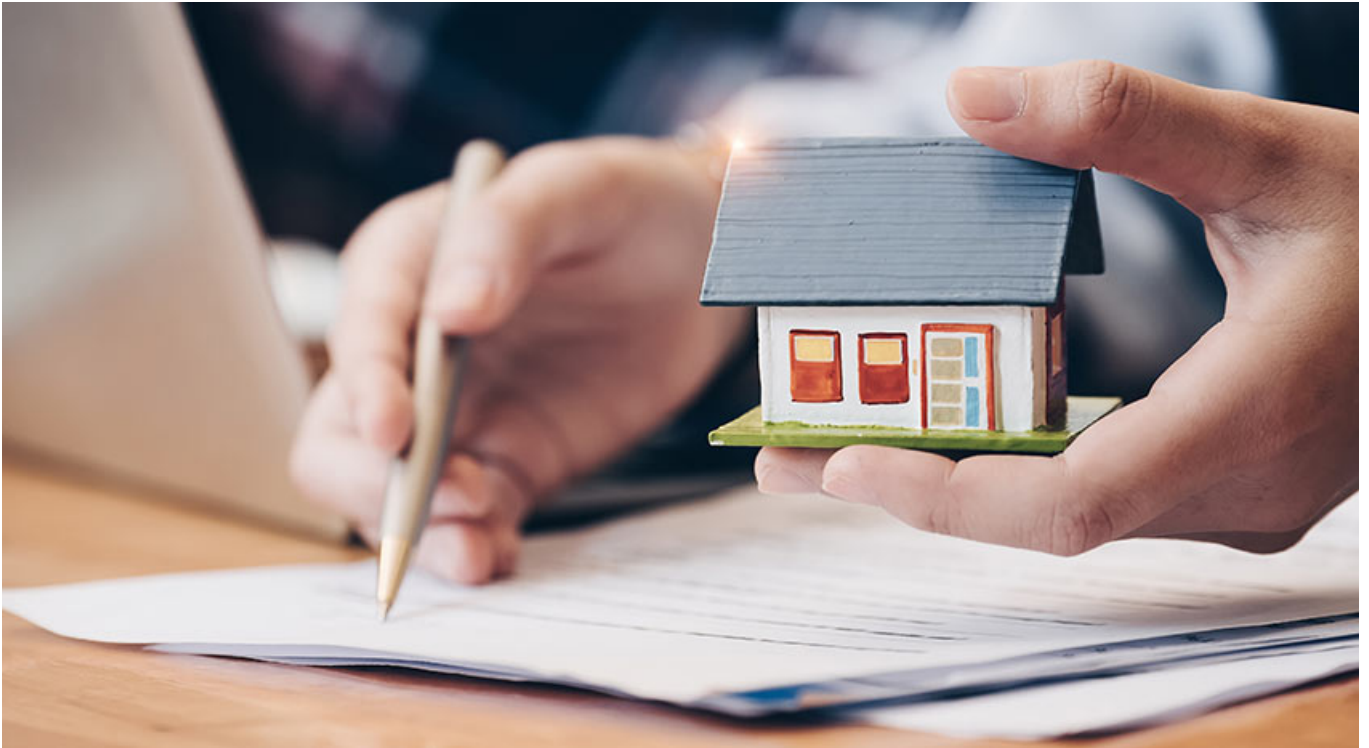
Prepare Your Family