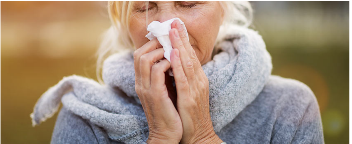
Older Adults & Medical Conditions