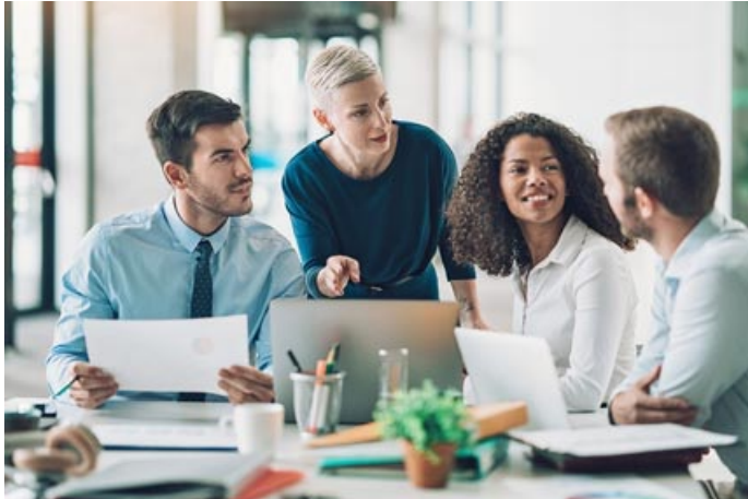
Businesses & Employers