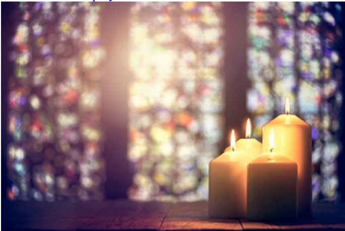
Community & Faith-Based Organizations