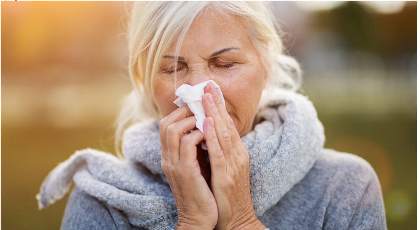
Older Adults & Medical Conditions