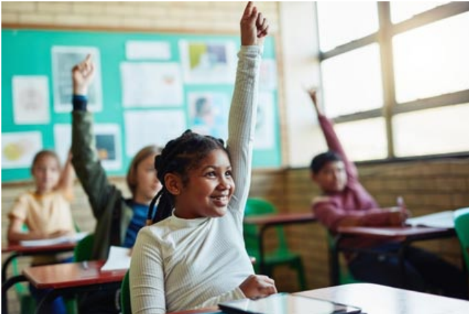
Schools & Childcare