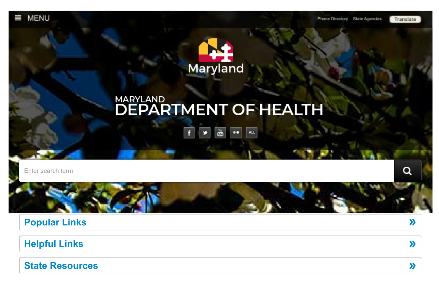
March 13, 2020