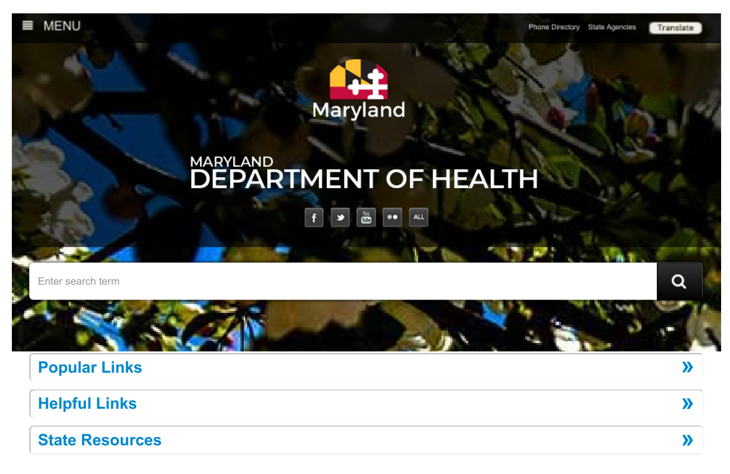
March 16, 2020