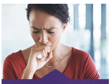
Prevention, Symptoms, Treatment and Transmission