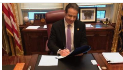
Bill Signed for Paid Sick Leave for COVID-19

Sign up for email updates from New York State with critical information on the Coronavirus pandemic.