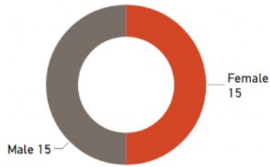
Gender of Cases