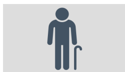
Older adults (65 years and older)