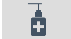
Use hand sanitizer as backup.