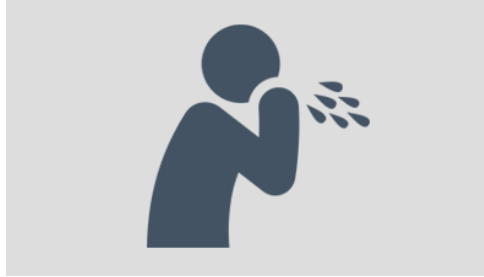
Cover coughs and sneezes.