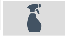
Disinfect often touched surfaces.