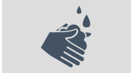
Wash hands with soap and water.

There is currently no vaccine to prevent COVID-19. The best way to prevent infection is to take steps to avoid exposure to this virus, which are similar to the steps you take to avoid the flu.