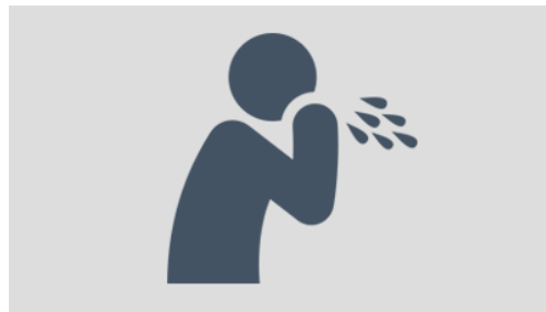
Cover coughs and sneezes.