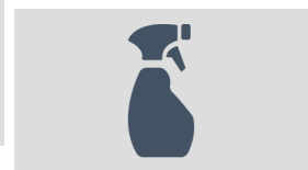
Disinfect often touched surfaces.