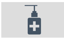
Use hand sanitizer as backup.