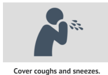
Cover coughs and sneezes.