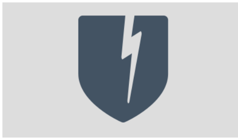
Weakened Immune Systems