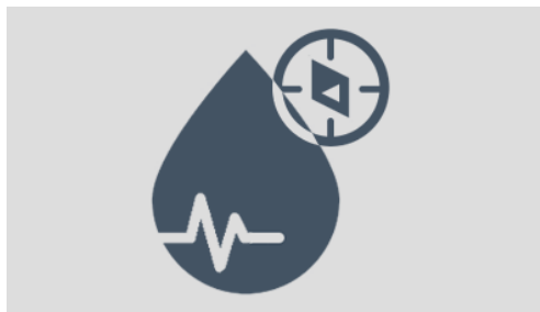
High Blood Pressure