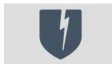
Weakened Immune Systems