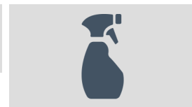
Disinfect often touched surfaces.