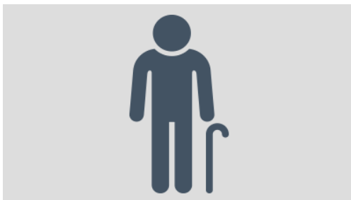
Older adults (65 years and older)