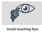
Avoid touching face.