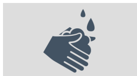
Wash hands with soap and water.

There is currently no vaccine to prevent COVID-19. The best way to prevent infection is to take steps to avoid exposure to this virus, which are similar to the steps you take to avoid the flu.