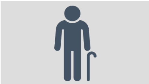
Older adults (65 years and older)