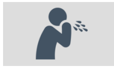
Cover coughs and sneezes.