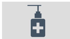
Use hand sanitizer as backup.