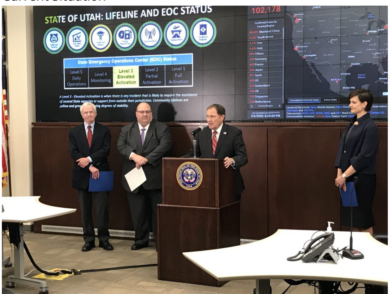
Utah Gov. Gary R. Herbert speaks at a press conference announcing the first case/first diagnosis of COVID-19 in Utah.

Utah health officials announced the state's first case of COVID-19 on March 6, 2020. Watch the press conference here: