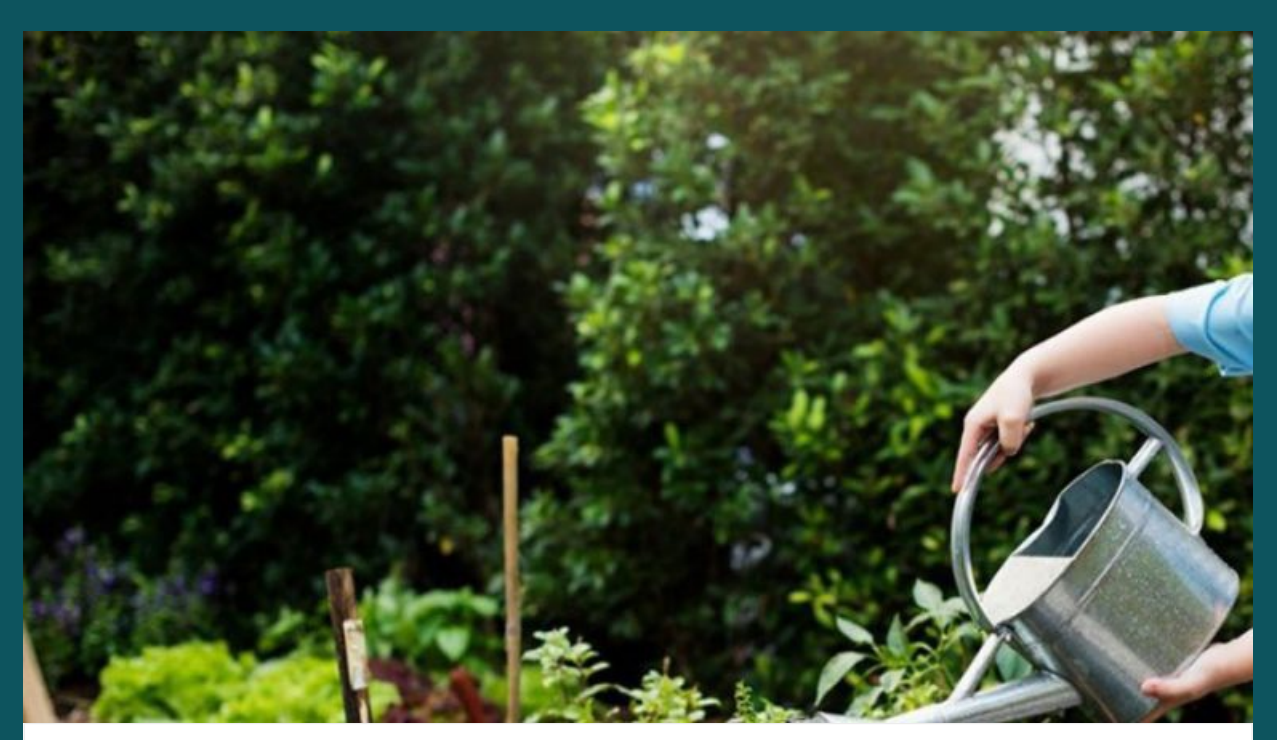
Entertaining Kids at Home MARCH 24, 2020