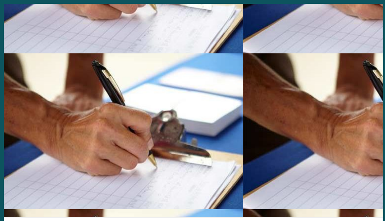
Gov. Herbert Suspends Sections of Utah Statute Regarding Signature Gathering MARCH 26, 2020