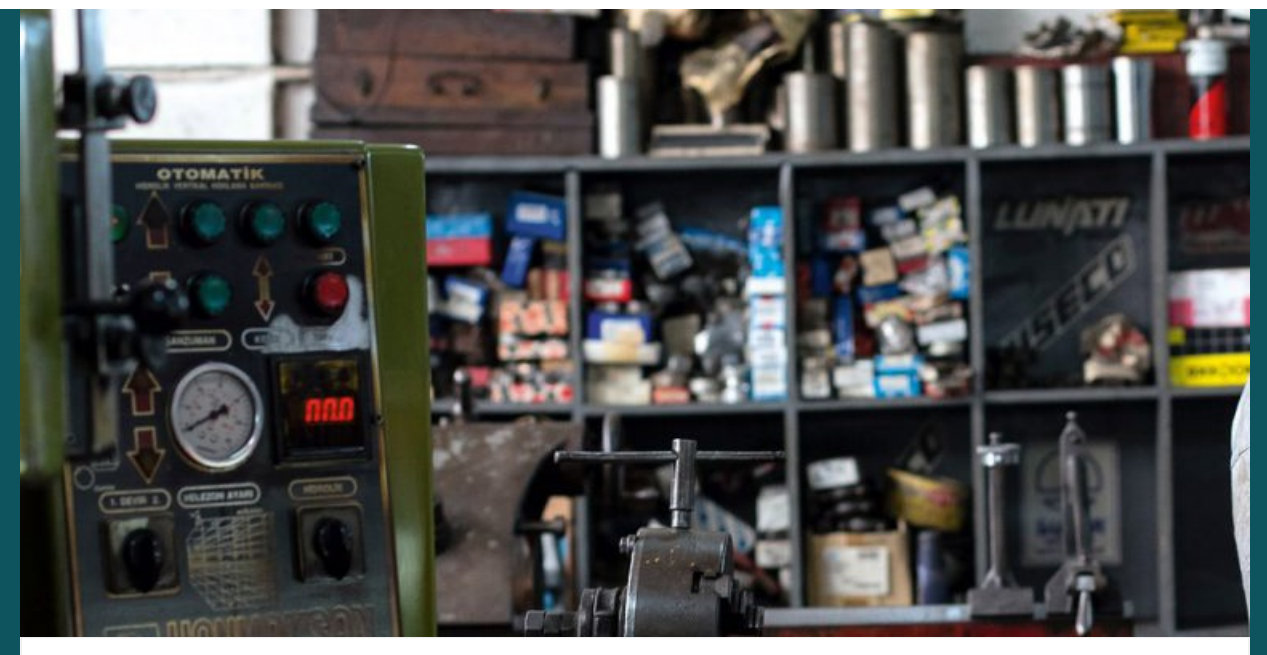
GOED Launches Plan to Offer Assistance to Small Businesses – Utah Leads Together Small Bu...