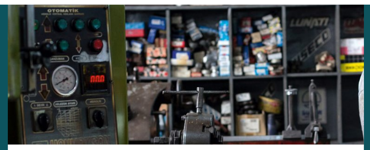
GOED Launches Plan to Offer Assistance to Small Businesses – Utah Leads Together Small Bu... MARCH 30, 2020