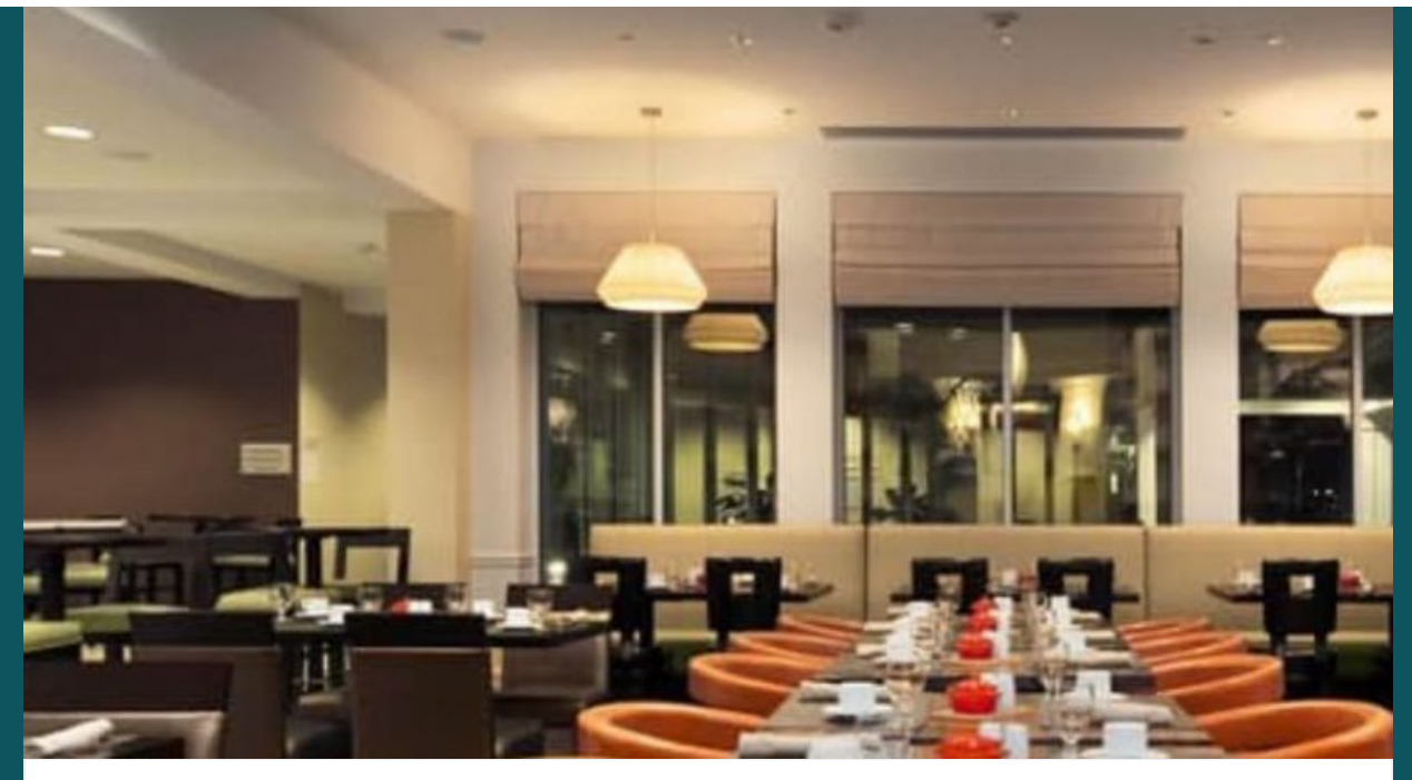
Public Health Order Extends Closure of Dine-In Options, Controlling Gatherings and Line For... APRIL 1, 2020