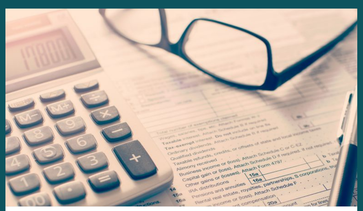
Utah Banks Ready to Approve Small Business Administration Loans APRIL 2, 2020