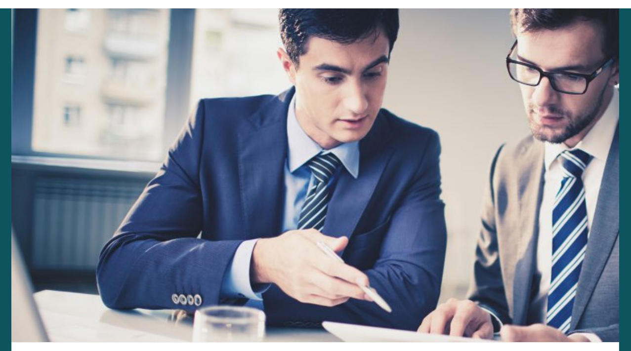
Utah Economic Response Task Force Facts & FAQs: How to Apply for an SBA Loan APRIL 2, 2020