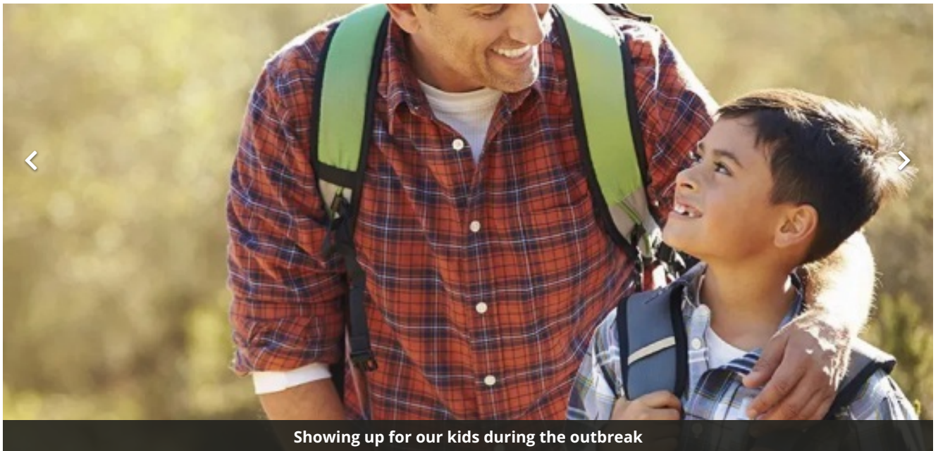
Showing up for our kids during the outbreak

Visit the Public Health Insider blog for more articles on COVID-19.