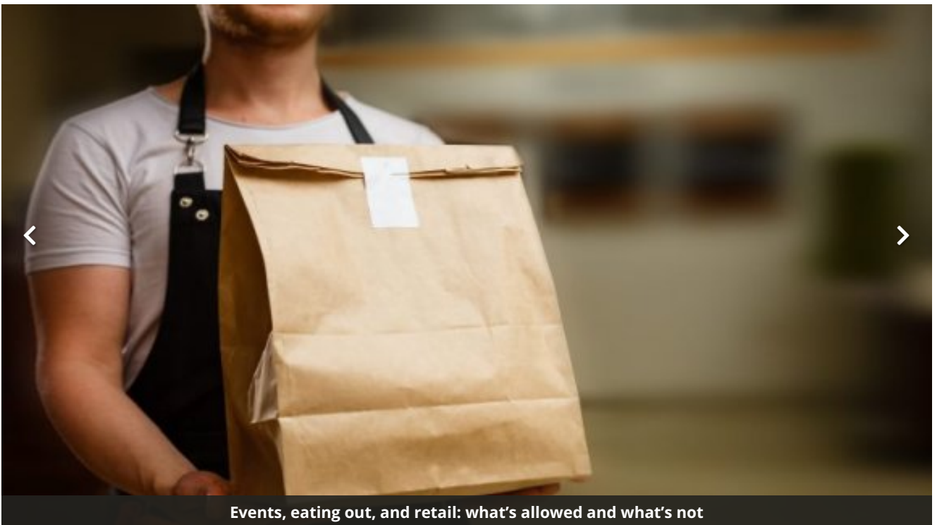
Events, eating out, and retail: what's allowed and what's not