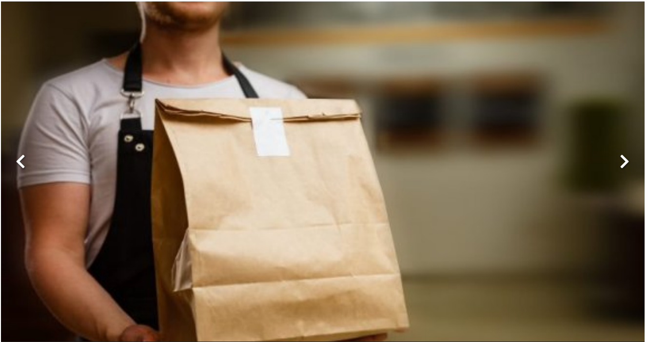
Events, eating out, and retail: what's allowed and what's not