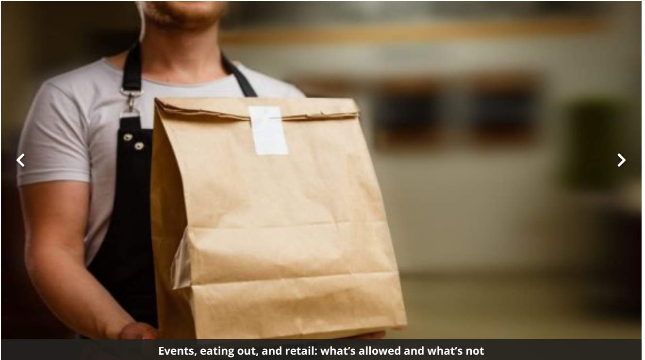
Events, eating out, and retail: what's allowed and what's not