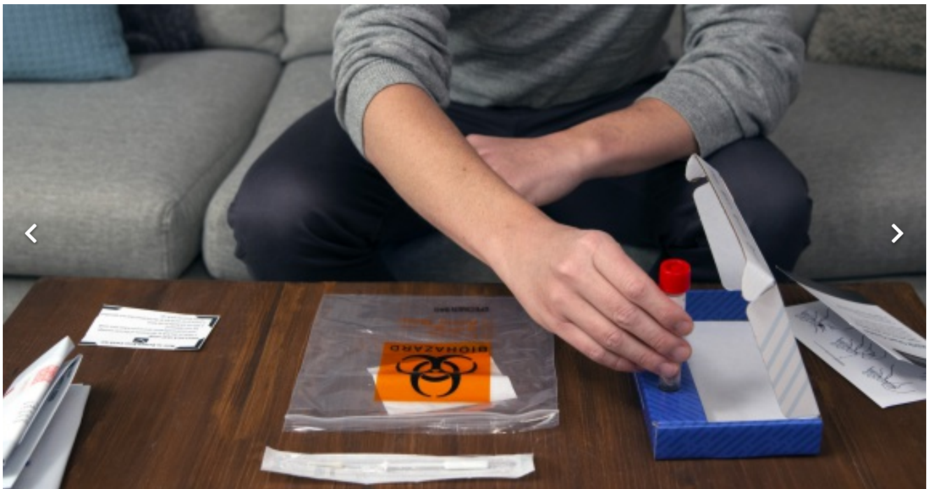
Introducing SCAN: the greater Seattle Coronavirus Assessment Network

📖 Visit the Public Health Insider blog for more articles on COVID-19.