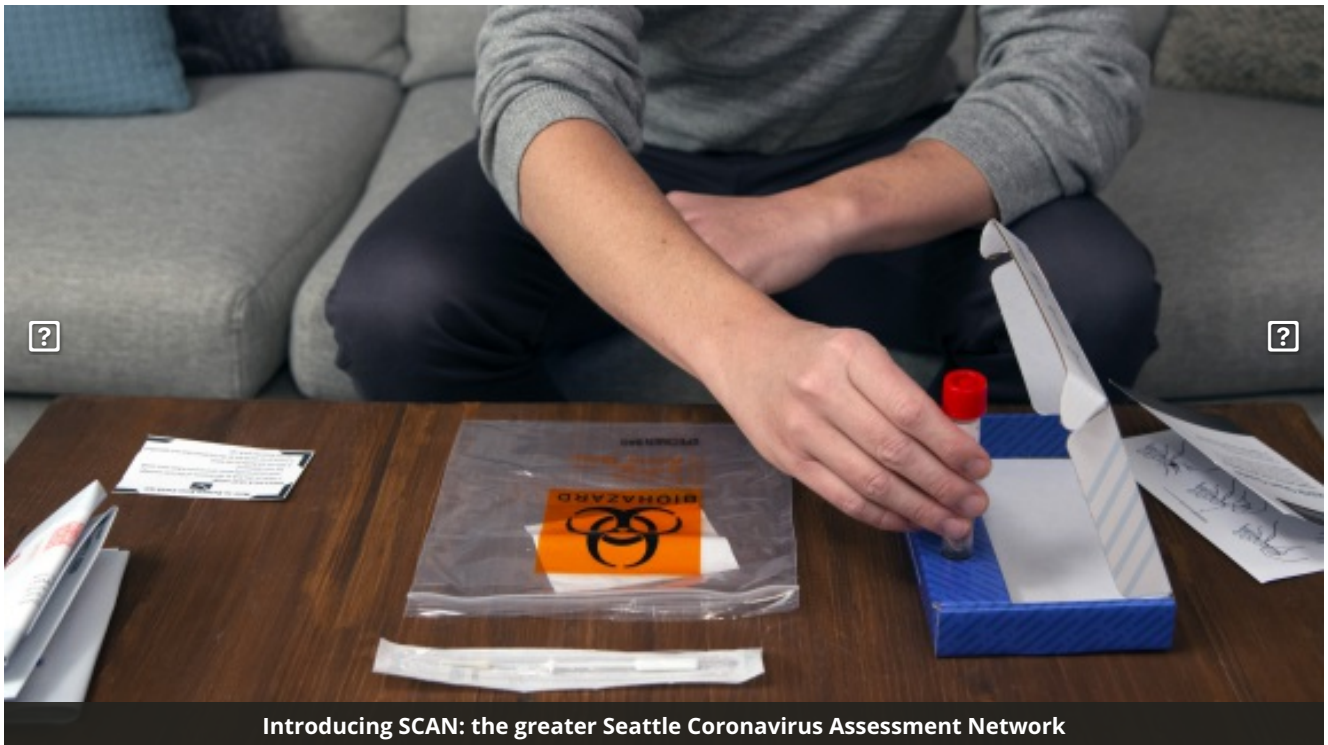
Introducing SCAN: the greater Seattle Coronavirus Assessment Network

? Visit the Public Health Insider blog for more articles on COVID-19.