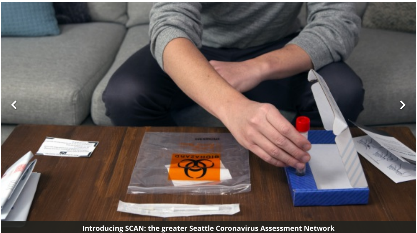
Introducing SCAN: the greater Seattle Coronavirus Assessment Network