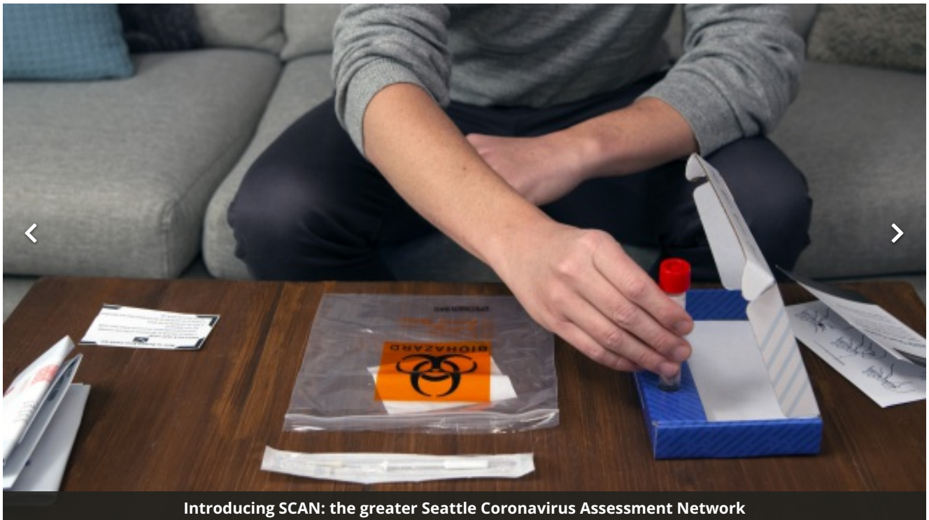
Introducing SCAN: the greater Seattle Coronavirus Assessment Network

📖 Visit the Public Health Insider blog for more articles on COVID-19.