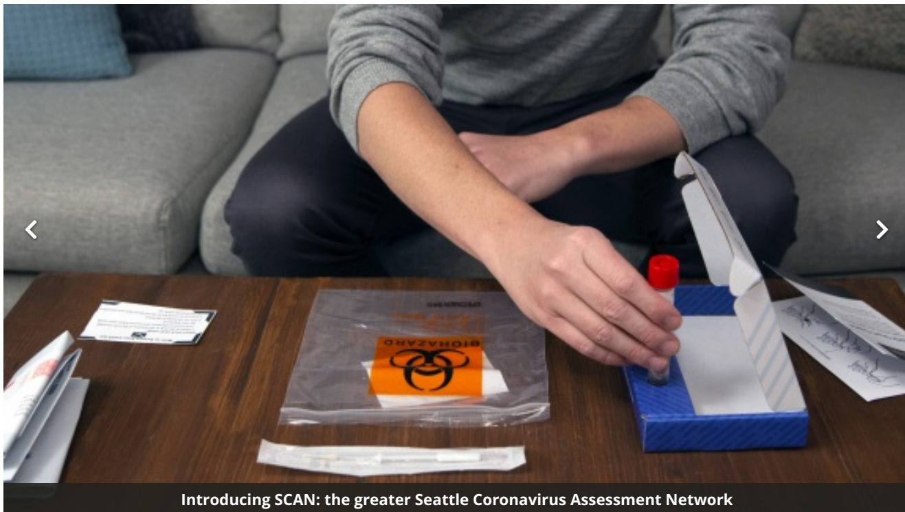
Introducing SCAN: the greater Seattle Coronavirus Assessment Network

For service providers and healthcare providers