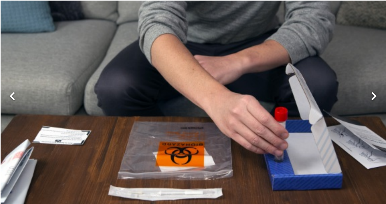
Introducing SCAN: the greater Seattle Coronavirus Assessment Network

Visit the Public Health Insider blog for more articles on COVID-19.